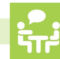
Consulting on professional recognition